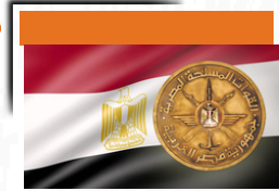
Egyptian Defence Office